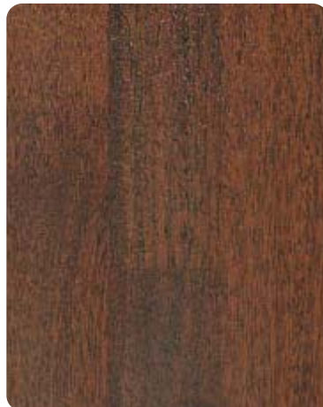
Merbau 3 Strip D-321