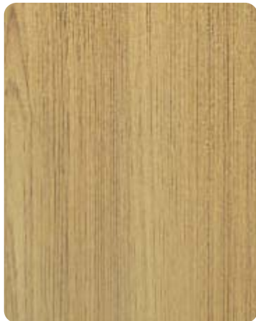
Siom Teak D-053