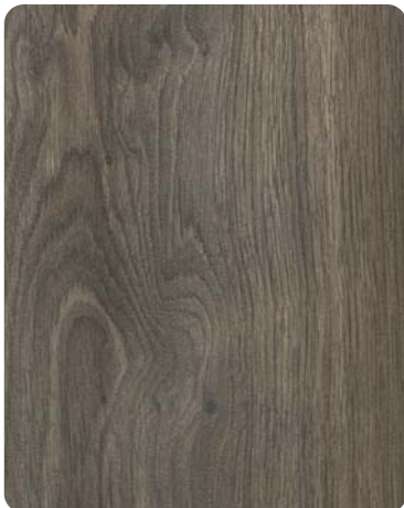
Italian Oak D-041