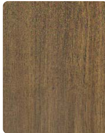
Tabacco Oak D-095