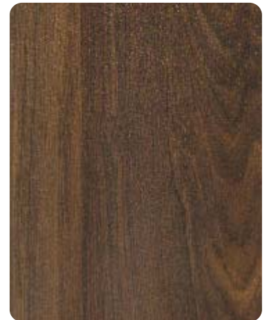
Walnut 3 Strip D-357