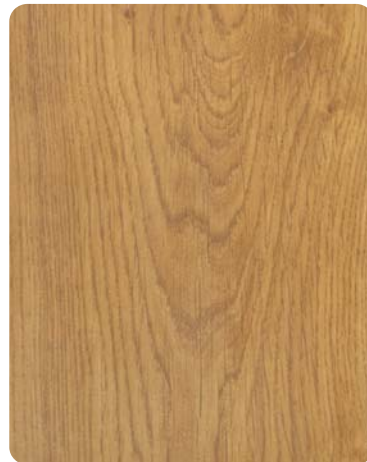
Summer Oak D-142