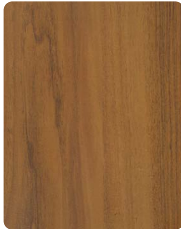
Honey Acacia D-108