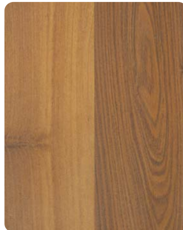
Nordic Cherry D-270