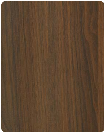
American Walnut D-111