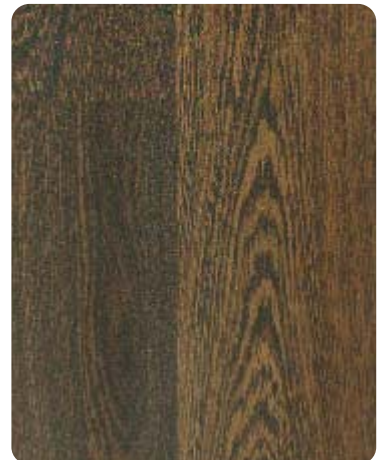
Panga Panga D-036